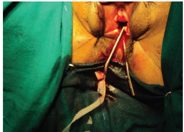
Figure 4 – Passage of hand-made polypropylene sling.

Only two (11.1%) patients in group 1 did not have a normal urinary stream 30 days after surgery,