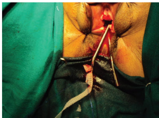
Figure 4 – Passage of hand-made polypropylene sling.

Only two (11.1%) patients in group 1 did not have a normal urinary stream 30 days after surgery,