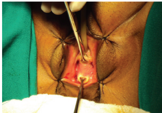
Figure 3 - Incision of mid urethra for introduction of sling.

zil according to electronic price quotation ( http://www2.ciashop.com.br/cpassos ). This mesh was divided into 20 segments of 1.5 x 30 cm, with one segment being used per surgery, corresponding to a cost per patient of approximately R$ 13.05 (R$ 261.00/20 segments). In contrast, the commercial sling system (Advantage®) costs R$ 1.800.00 according to the Financial Sector of Covenants Box Health Care Emmployess of the Bank of Brazil (CASSI).