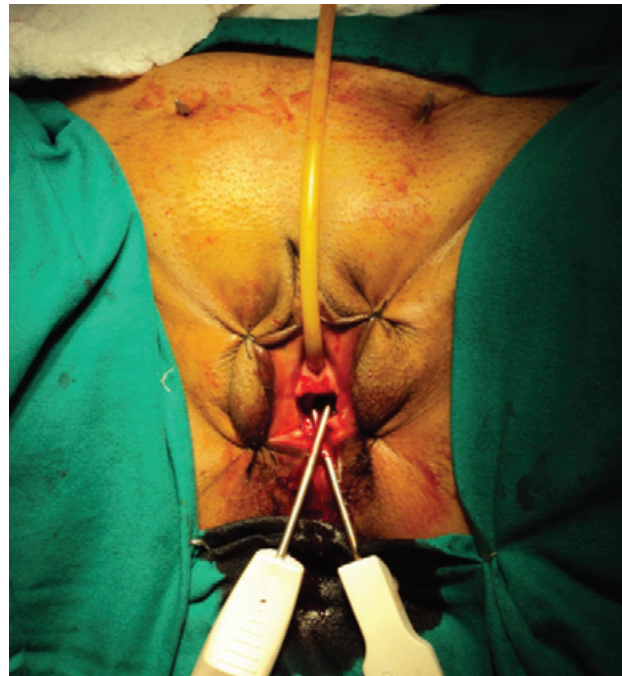
Figure 2 - Stamey needles introduction.

The hand-made sling used in this study was fabricated from an original Marlex® mesh (30.5 x 30.5 cm), which costs R$ 261.00 in Bra-