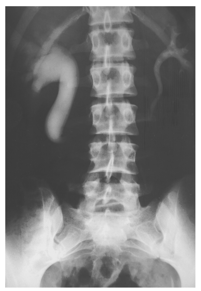
Figure 1 – Excretory urography showing proximal uretero-hydronephrosis and typical "J" configuration of retrocaval ureter.

the extremity of the 12th rib, while observing which would be the point with the least tension for exteriorization. The ureter was sectioned at this site. The ureteral stumps were exteriorized through the incision of the 12-mm port after enlarging the skin incision to 20 mm. The proximal and distal ureteral margins were resected and a good vascularization was observed. We performed a continuous spatulate suture on the posterior aspect of the ureter using monocryl 4-0. A double-J catheter was then inserted. The anterior ureter was sutured like the posterior aspect. The ureter was repositioned at its usual location (Figure-3) and a Penrose was inserted for drainage. Total surgical time was 130 minutes, 40 minutes of which were employed for the anastomosis. Estimated bleeding was 50 mL and there were no intraoperative complications. The patient was discharged from hospital on