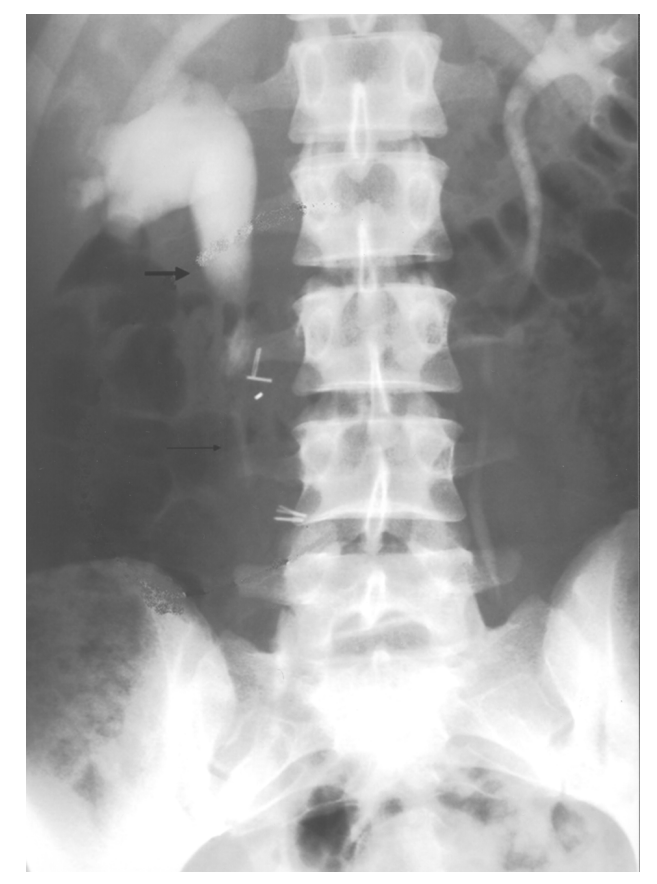
Figure 4 – Excretory urography performed after reconstruction showing good drainage of the ureter (thick arrow = pre-anastomosis; thin arrow = post-anastomosis).

We are presenting here a technique that offers a feasible, efficacious and fast alternative for cases where it is possible to exteriorize the stumps that will be anastomosed. Difficulties resulting from the intracorporeal suture, which is more significant when the extraperitoneal access is preferred, are thus eliminated. Antegrade insertion of the double-J catheter prevents the endoscopic approach from being performed at the beginning. The patient's body habitus is important in order to safely accomplish this approach. The proper planning of the site where the ureter should be sectioned, the perfect maintenance of its irrigation properties and a proper assessment of the ureteral segment's feasibility are fundamental for