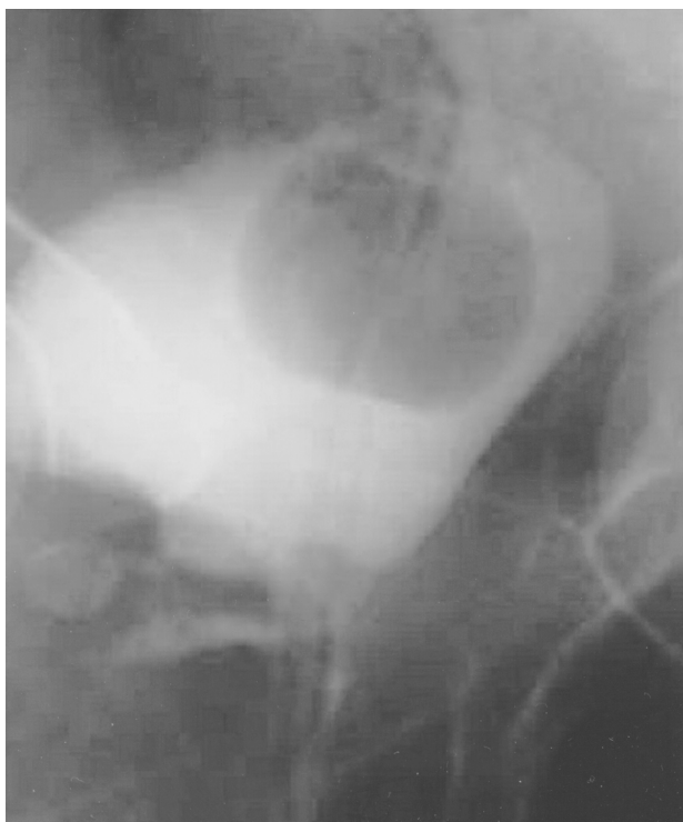
Figure 4 - Cystographic control showing minimum extravasation of contrast medium and descending of bladder to its anatomical position.

Foley catheter was effective. The incidence of disruption of vesicourethral anastomosis is 0.2% to 0.5% (7-9) and the best management is still a subject for discussion.