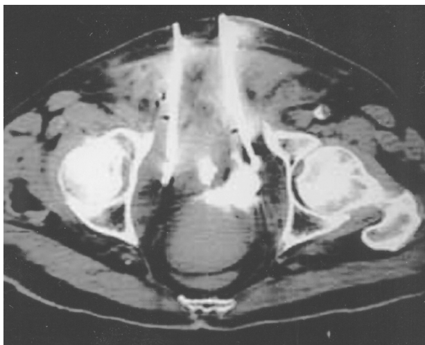
Figure 2 - Percutaneous drainage of hematoma, guided by computerized tomography.

This work demonstrated that conservative management for treating post-RRP rupture of vesicourethral anastomosis through permanence of