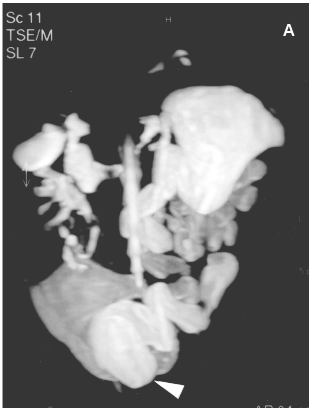
Figure 1 A – Weighted image in T2, in frontal plane, showing pyeloureteral duplication and ureterocele (arrow).

ily localized by ultrasound, but it is impaired in ectopic or slightly dilated ureters. Computerized tomography can be employed as an alternative diagnostic technical modality; however, the exposure to high doses of radiation restricts its use in pediatrics (2).