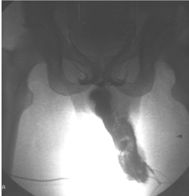
Figure 1 – Corporeal cavernosography demonstrating irreversible fibrosis of the cavernosal tissue after an episode of painful priapism lasting more than 48 hours.

helial and trabecula destruction of the erectile tissue and subsequently in permanent erectile dysfunction (2) (Figure-1). After 48h widespread smooth muscle necrosis will take place (3). The natural sequelae of untreated ischemic priapism is penile fibrosis and impotence (4). On their long-term follow-up (mean 66 months) El-Bahnasawy and co-workers reported only a 43% rate of preserved erectile function after a long lasting priapism (median range of duration 48h) (5).