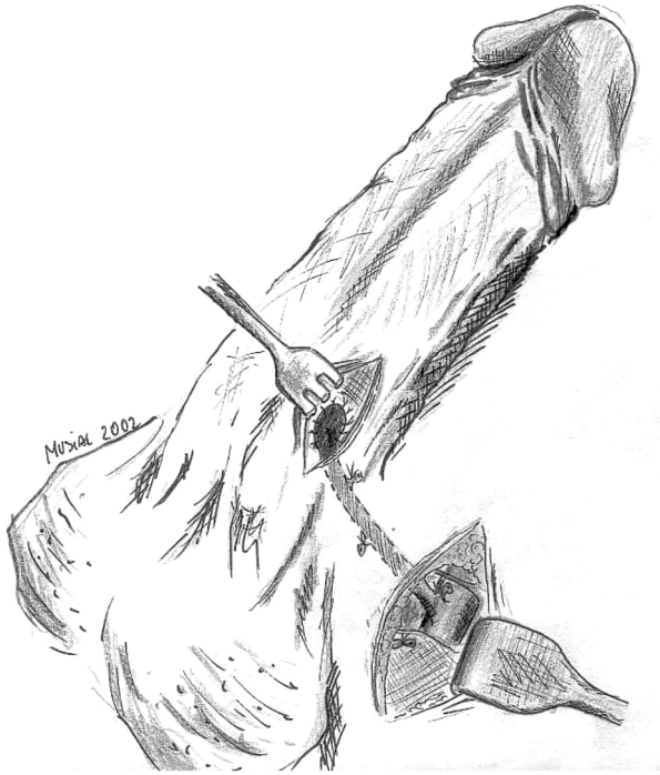
Figure 3 – Grayhack-shunt (saphenacavernous shunt)

Bastuba et al. to evaluate the use of selective penile arterial embolization (SPAE) (26). Candidates for SPAE underwent diagnostic arteriography of the pelvis with bilateral selective injections of the internal pudendal arteries that revealed a unilateral arterial-lacunar fistula in all cases first. A catheter was advanced up to the level of the ipsilateral common penile artery. Approximately 3 ml autologous clot were either unilaterally or bilaterally injected until complete stasis was achieved, producing a transient interruption of arterial flow. This resulted in immediate pain relief with subsequent detumescence in all the patients treated by SPAE. Post-embolization arteriogram studies documented the occlusion of the cavernous artery. Normal erectile function, with a delay of up to 5 months because of clot lysis, was restored in 86% of the patients. This group of investigators propagated SPAE as a successful treatment option for high-flow priapism attributed to trauma or A-V fistulas. Potential complications after emboliza-