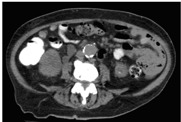
Figure 1 - Axial slice showed a hugely dilated left ureter with an air fluid level.

Fistula from the GI tract to the ureter is uncommon. Uretero-ileal fistulae as consequence of Crohn's disease occur with higher frequency than uretero-colonic fistulae (1,2). Uretero-colonic fistulae may be secondary to inflammatory disease of the large bowel, such as diverticulitis, obstructing ureteral calculi, or neoplasm of the colon that contiguously involves the ureter (3,4). A non-functioning kidney and ureter are often the consequence. CT is the modality of choice in working up urosepsis or renal colic, while antegrade or retrograde ureterogram is the most sensitive in the detection and characterization of a fistulous tract (5). In a like pathologic process, fistulization to the fallopian tubes can occur from diverticular abscesses. However, the incidence of colo-vesical fistulae caused by diverticulitis is higher (6).