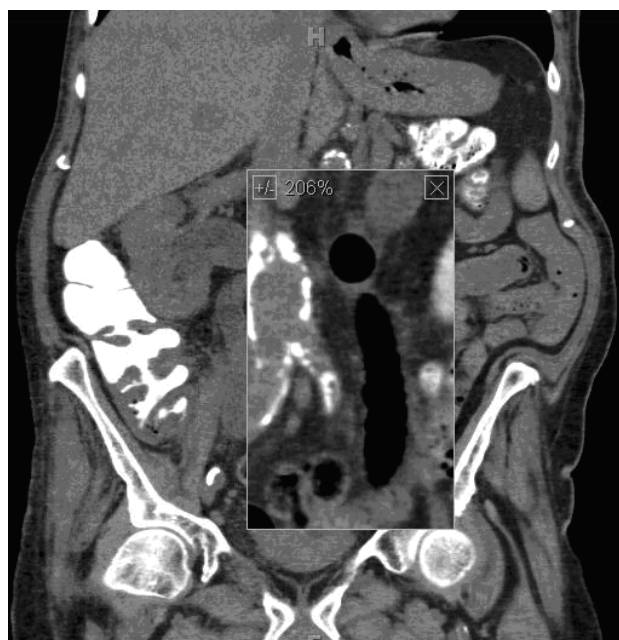
Figure 3 - Coronal reconstruction (206 % enlargement of area of interest) at a slightly more posterior level shows the entire left ureter dilated by gas.